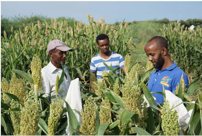
The cultivation of halophytic forages, integrated with livestock and appropriate management systems, can bring salt-affected soils back into production.

methods , including the planting of halophytic forages, integrated with livestock and appropriate management systems , could bring saline soils back into production.