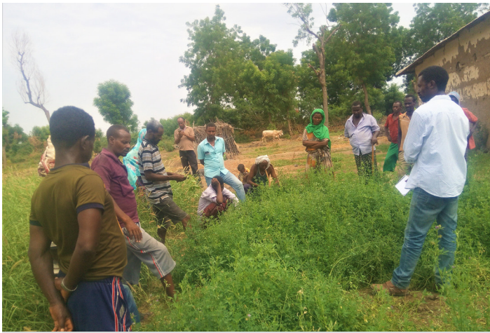
The project introduced and tested over 25 genotypes of different food and fodder crops and shrubs that produce excellent biomass.